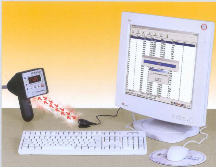
Direct digital data transfer to PC via infrared interface