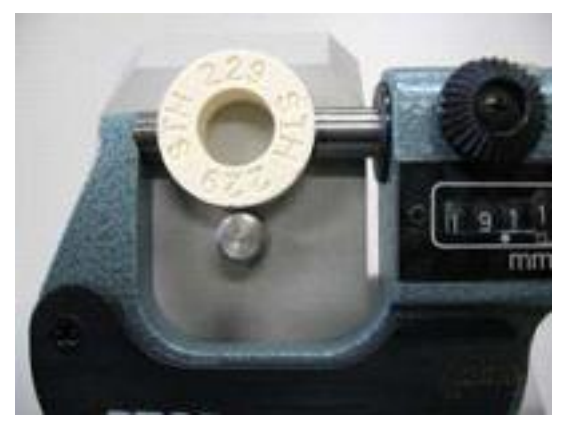
Fig. : Positioning the ring for measurement

After the firing cycle has been terminated, the ring diameter(s) have to be measured. Make sure that the rings are identifiable regarding their position in the kiln for mapping. Every ring only has to be measured once, the special PTCR micrometer ensures an operator independent, reliable and accurate reading of the ring diameter. In order to assure the reliability, the diameters have always to be measured between the two T's impressed in the ring (see picture).