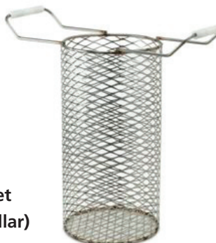
IFB-51 Basket (without collar)

All other larger IFB units have a robust stainless steel lid which supports the load of the basket and tooling. These also form part of the fume extraction system.