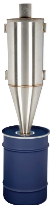
CN-100 Cyclone and collection bin