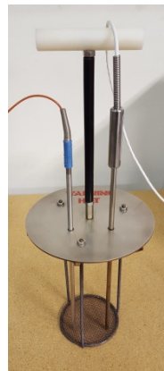
Bath Lid with Probe support

The lid is easily modified for immersing apparatus, assemblies and small reactors for heating.