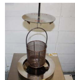
Bath Lid with Parts Basket